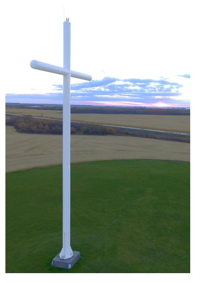
MILLENNIUM 2000 CROSS

10.8 km north east of Aberdeen, SK on Highway 41