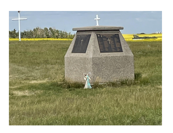
Two bronze donors' plaques on a concrete cairn at the cross site