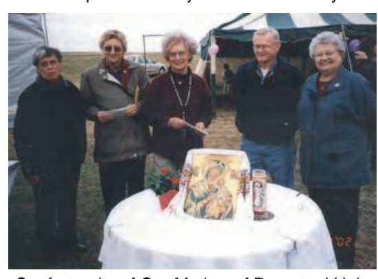
Confraternity of Our Mother of Perpetual Help