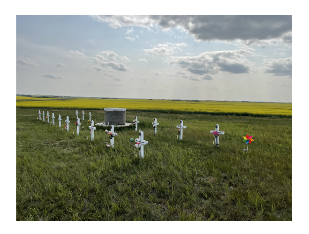
Memorial crosses for miscarried babies