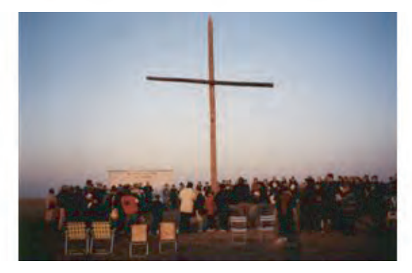
Oct. 15, 2000: The first annual pilgrimage