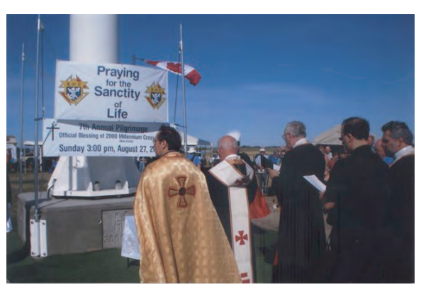
Aug. 27, 2006: Bishop Wiwchar blesses the cross